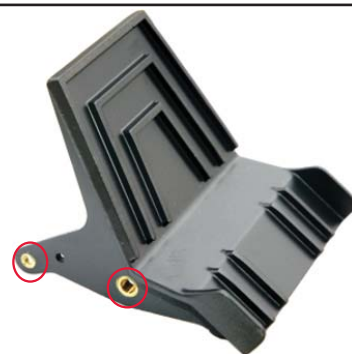
Bronze bushings for a longer life!