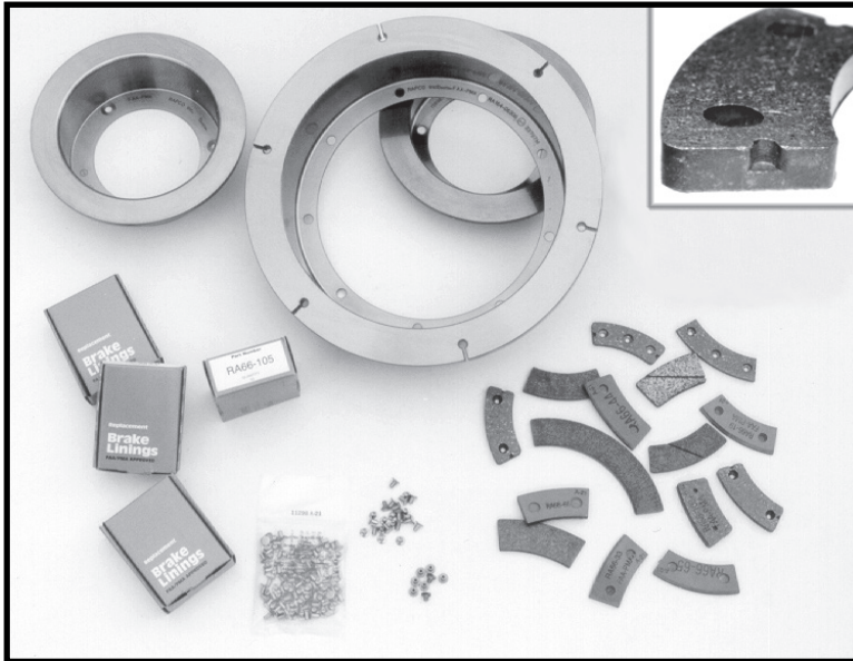
FAA-PMA Approved Brake Disc, Lining, Rivet and Mounting Pin Replacements for Cleveland and McCauley Wheel and Brake Assemblies